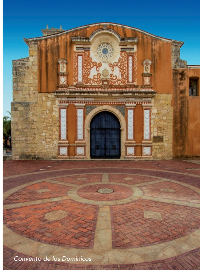
Convento de los Dominicos