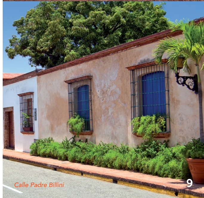
Calle Padre Billini