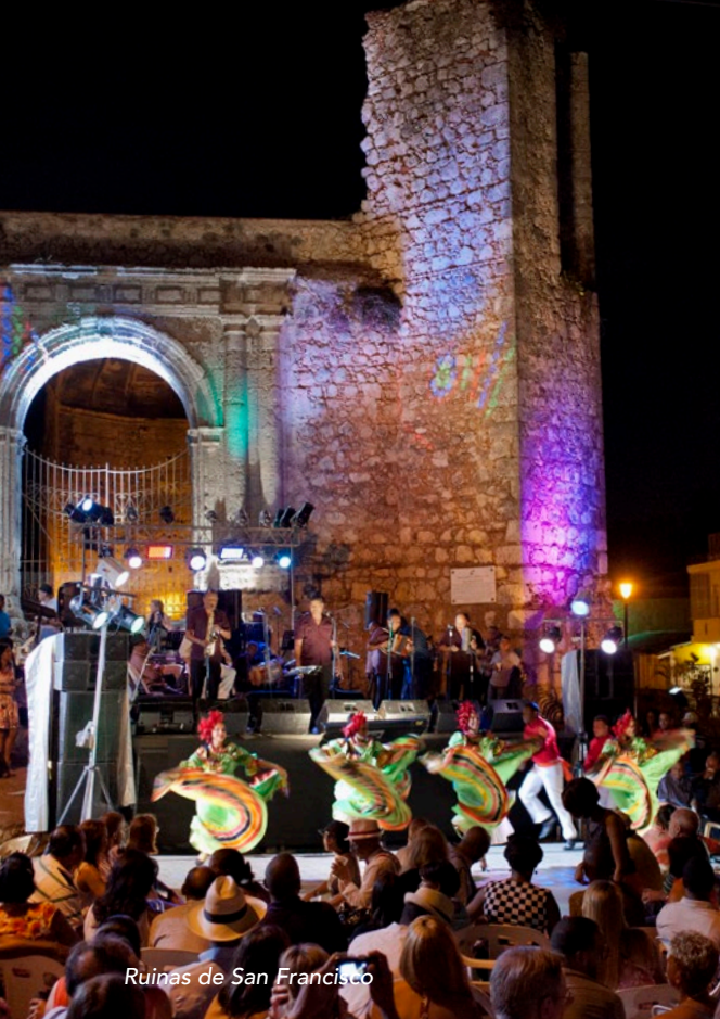
Ruinas de San Francisco