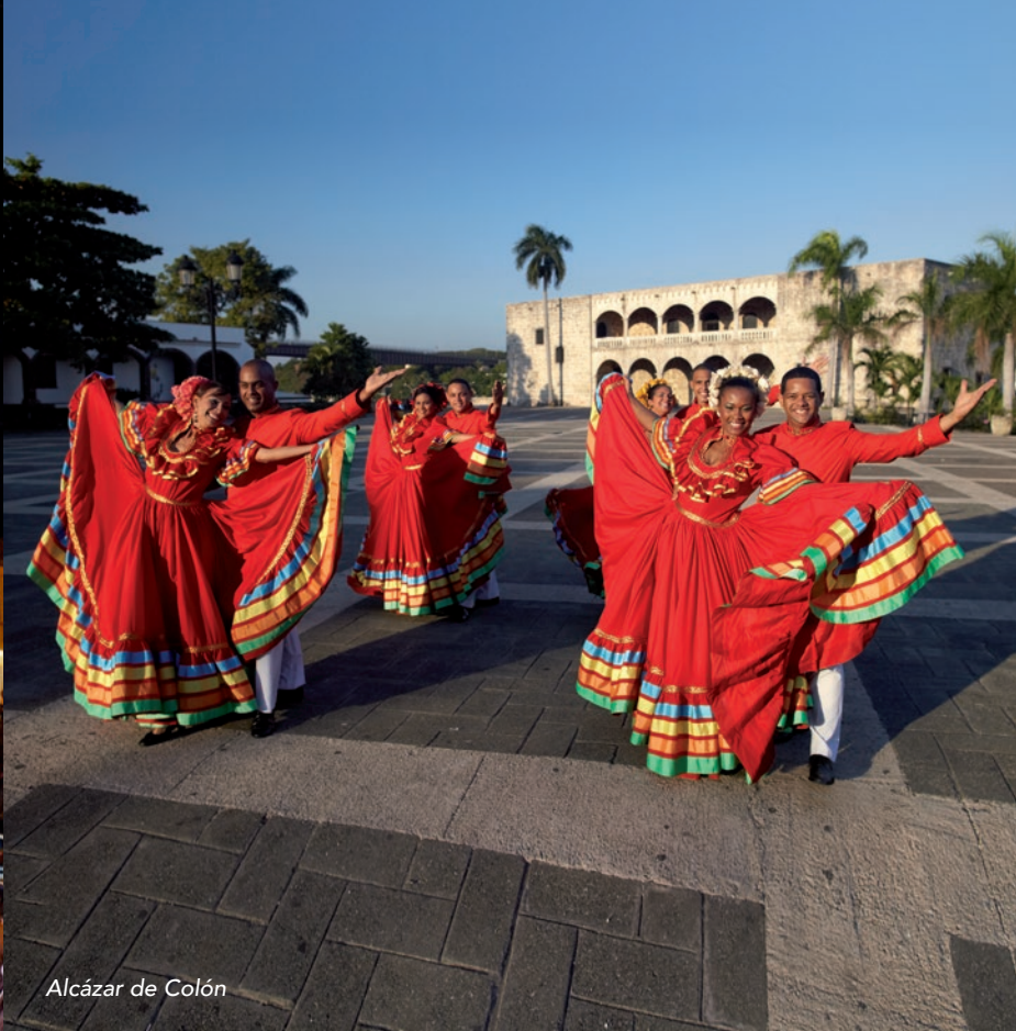
Alcázar de Colón

LONG NIGHT OF MUSEUMS: Held twice a year during the months of August and December, this cultural event allows visitors to explore numerous museums and other cultural institutions for free late into the night. The event includes concerts, arts and crafts, food tasting, folk dances, lectures, theater and more.