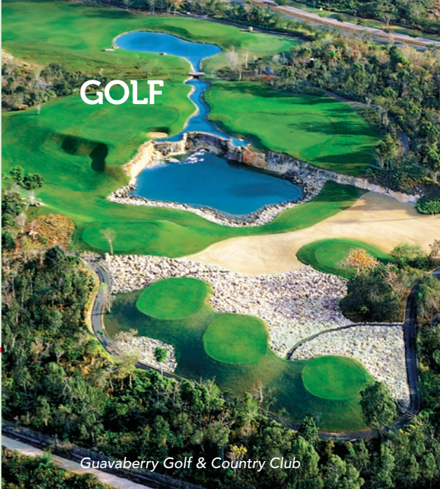
Guavaberry Golf & Country Club

Dominican Republic's capital city of Santo Domingo offers golfers access to world-class courses within a thriving metropolis that overflows with vivacious culture. A hotbed for golf, this region caters to those who appreciate modern sophistication amid a rich historical background. If you seek an idyllic golfing escape from the energetic capital city, you need only travel an hour or less to enjoy a peaceful course in the nearby beach town of Juan Dolio.